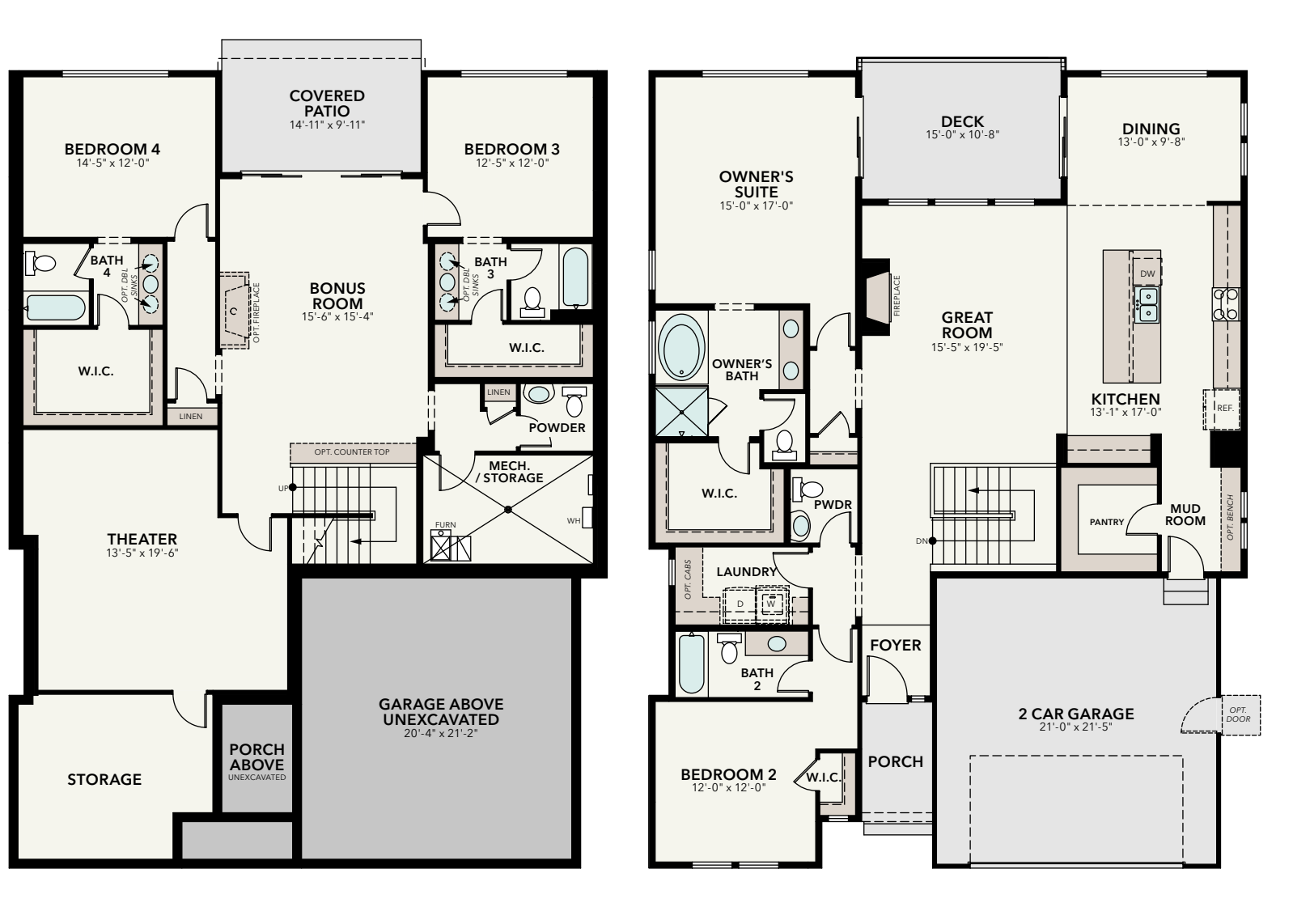
BASEMENT FIRST FLOOR